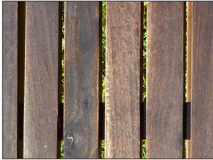
Timber prior to cleaning